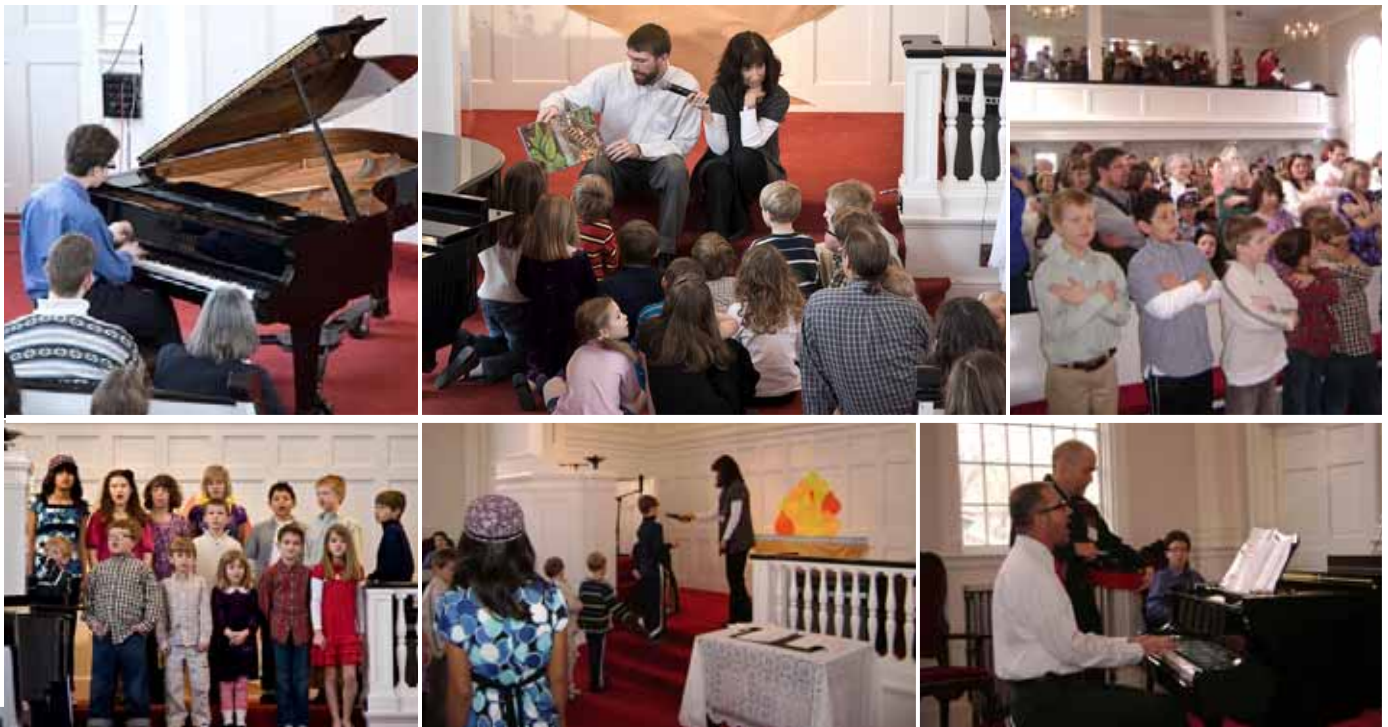
February 7th RE Service