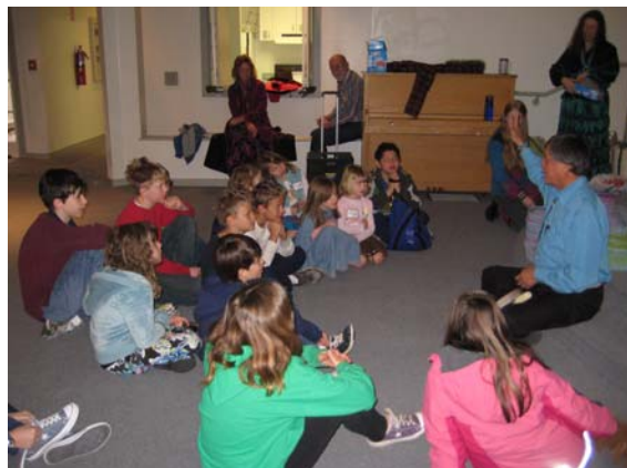
The youth in RE prepared care packages for Native American elders on Social Justice Sunday - March 6, 2011