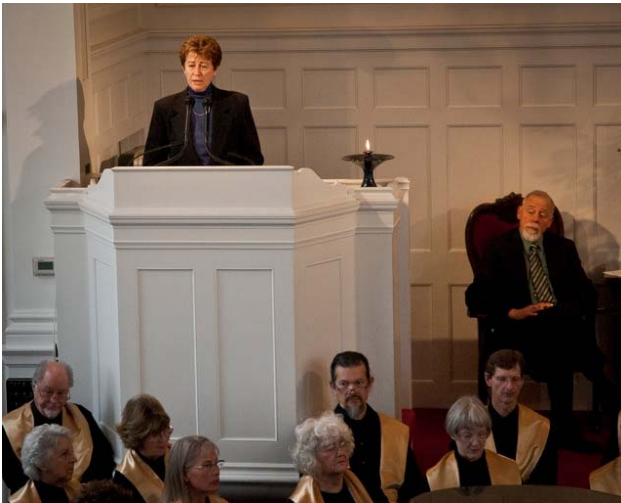
Celebration Sunday March 6, 2011