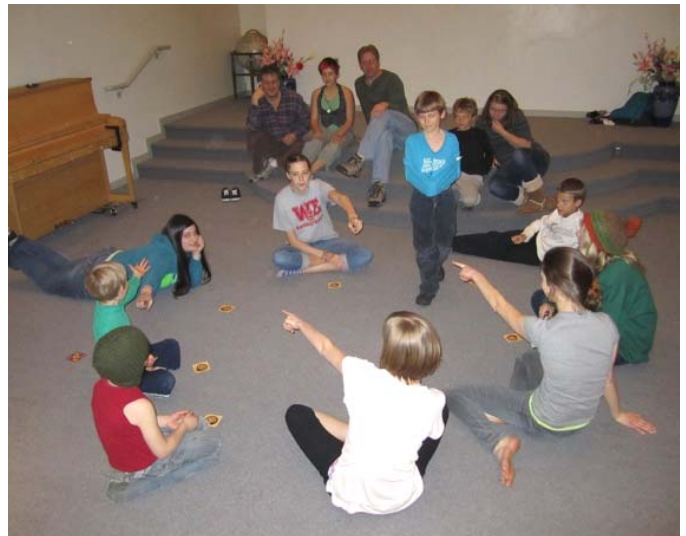
Photos from the Intergenerational Game Night and Potluck April 9, 2011